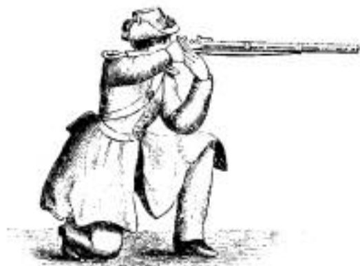
To fire kneeling.—No. 301.