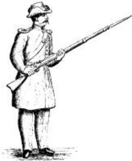
Charge bayonet.—No. 292.