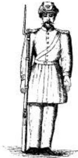
Ordered arms.—No. 156.