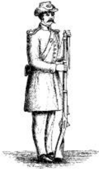
Unjta bayonet.—No. 209.