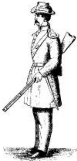
Secure Arms.--No. 218.