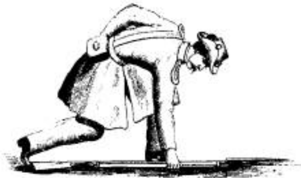
Ground Arms.—No. 231.