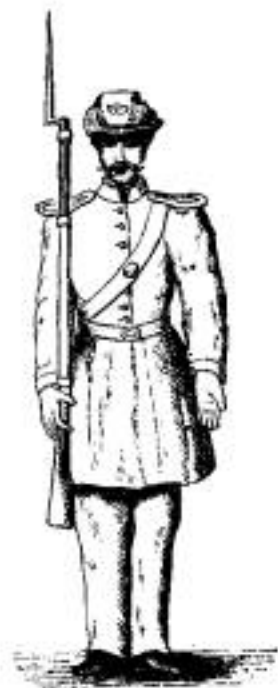
Shouldered Arms.—No. 127.