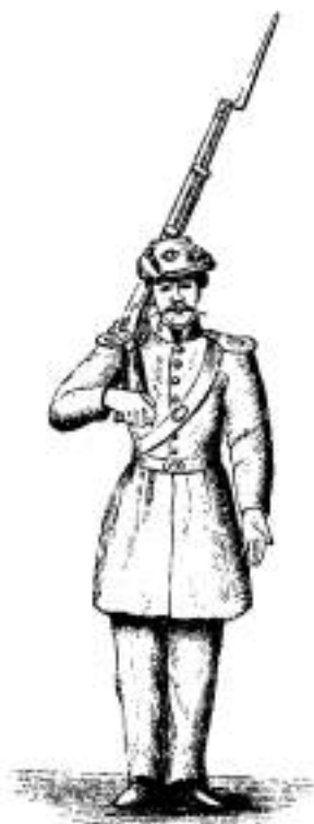
Right shoulder shift arms.—No. 219.