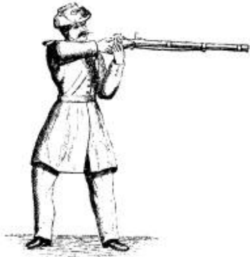
When deployed as skirmisher, to aim with rear sight at high elevation.