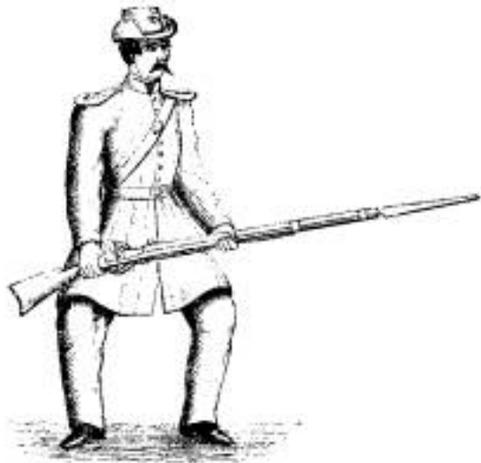
Guard against Infantry.—No. 314.