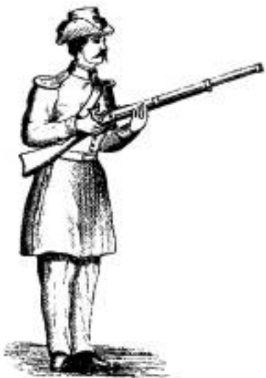
Prime. — No. 174.