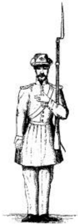
Support Arms.—No. 189.