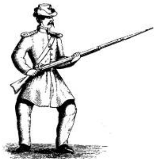
Guard against Cavalry.—No. 317.